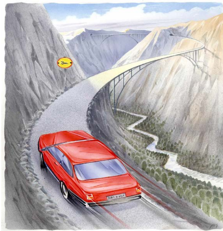
Fig. 2: Horizontal vs. vertical

Maybe the road administration would know why certain regulations are necessary, but road users would not understand. Therefore, efforts needs to be made to design road environment in a reasonable way, because infrastructure influences the behaviour of road users constantly: the mentioned wide and straight roads encourage higher speeds, suggest (psychologically) priority at crossings, draw the focal attention to the front and therefore worsen peripheral vision in the immediate vicinity.